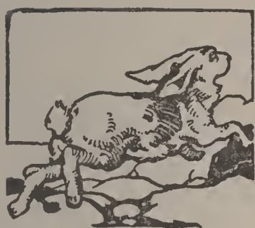
Spot Rushed For the Mud Mound.

J ACK and Evelyn reminded daddy that he hadn't told them a story for ever so long about a bunny rabbit.